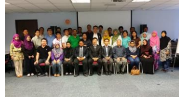
MSMA Seminar on Detention Basin on 13 March 2015 at IEM, PJ

We will be giving out Free Lite version of MSMAware to all participants of the seminar!